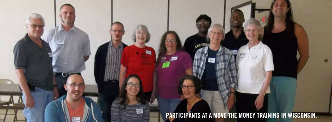
PARTICIPANTS AT A MOVE THE MONEY TRAINING IN WISCONSIN.